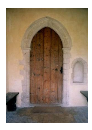
1363. An ancient document informs us that at Whitsuntide this year the church was "built anew". Looking at the church, it is clear that a major reordering took place at this time, when England was recovering from the Black Death and when the Decorated Style was beginning to develop into the Perpendicular Style of architecture. It appears that this work